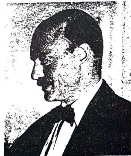
DR. JEROME C. HUNSAKER

Gordon Gray, who succeeded Kenneth C. Royall as Secretary of the Army in June 1949, first came to the Pentagon Building in September 1947, as Assistant Secretary. He is widely known as chief author of the so-called "Gray Report," which recommended the placing of the National Guard under the control of the Federal Government instead of the separate States, in the interest of modern defense needs. A veteran of World War II, in which he served both as enlisted man and officer, Gray, a Democrat, is a lawyer by training, and has three times been elected to the Senate of North Carolina. From 1937 to 1947 he was publisher of two newspapers of that State, in Winston-Salem.