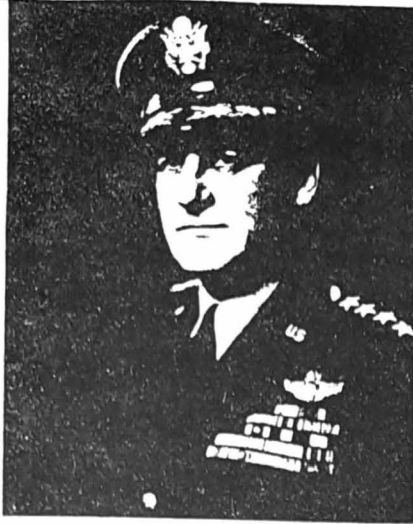
U. S. Air Force